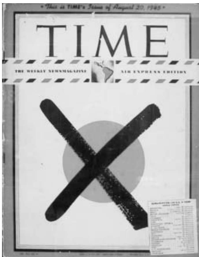
Fig. 2. Cover of Time magazine (20 August 1945) acquired on E-Bay and exhibited at Spinnwebzeit: Die EBay-Vernetzung.

Such a reading is supported by a series of drawings of burn victims from Hiroshima and Nagasaki in the next gallery in the museum, representing On Kawara's pre-conceptualist work (1953–56) and published as Thanatophanies in 1995. 18 The drawings, which evoke trauma in form and content, access similar psychic material as the surrealist-inflected drawings On Kawara made before his turn to conceptual art and his refusal to return to Japan or to use Japanese characters in his work. A plausi-