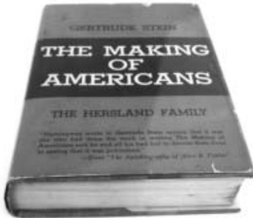
Fig. 1. Copy of Gertrude Stein's The Making of Americans (1934) acquired on E-Bay and exhibited at Spinnwebzeit: Die EBay-Vernetzung [Spinning the Web: The E-Bay Connection], Museum der Moderne Kunst, Frankfurt-am-Main, 2005.

sition of one of his date paintings ( July 1, 1974 ) with a copy of Time magazine accessioned on E-Bay (dated August 20, 1945 ; fig. 2). The juxtaposition of the date painting with a record of a punctual event (if there ever was one, the bombings of Hiroshima and Nagasaki) created a complex interweaving of interpretive frames. In the Time cover, the abstract graphic—the Japanese sun emblem being crossed out by the American X—reduces human tragedy to a cipher and suggested similarly negative interpretations of conceptual art. Just so, in its dominant, Anglo-American form, conceptual art may connect to American war crimes as a distancing form of abstraction that conveys cultural supremacy and denial of humanity. The date paintings thus might refer in some way to the form of denial of the Time cover.